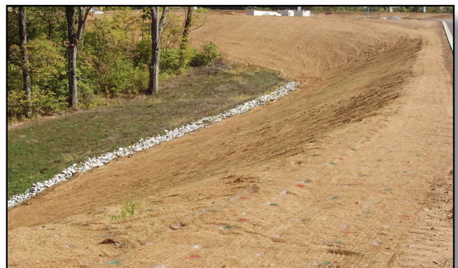
Biodegradable ECBs offer an environmentally-friendly alternative to traditional photodegradable ECBs in high-risk areas.