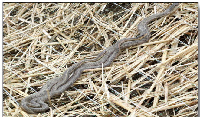
Synthetic components can increase the risk of wildlife entrapment.